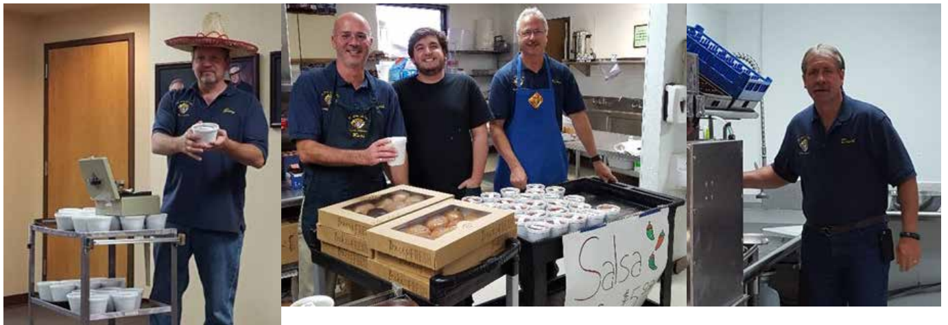
St. Joan of Arc Council 12392 were able to sell over 230 containers of salsa to help the fire victims in California. With the help of all the Knights they are donating several thousand dollars to the relief efforts.