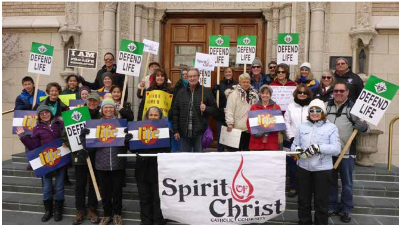
Council 12979 participating in the Celebrate Life Rally and March on January 12, 2019 in downtown Denver.