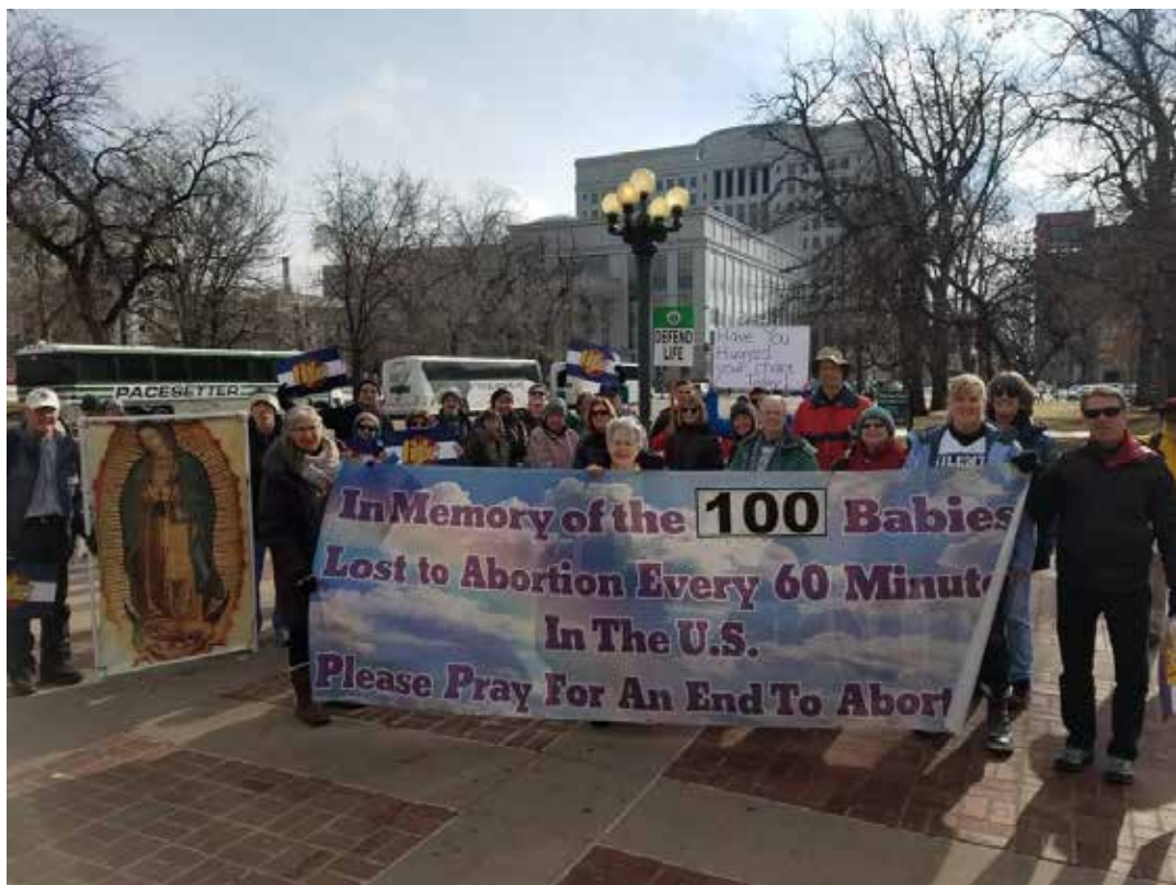
Members of St. Peter's Council and Father Kekeisen Assembly join in the State Rally and March for Life in Denver on Saturday, 12 January 2019.